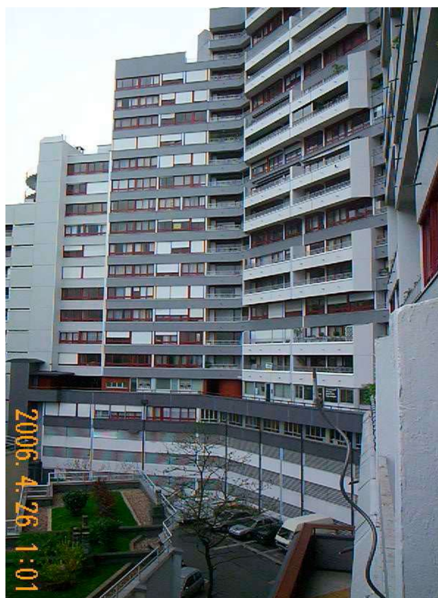
General view of the building