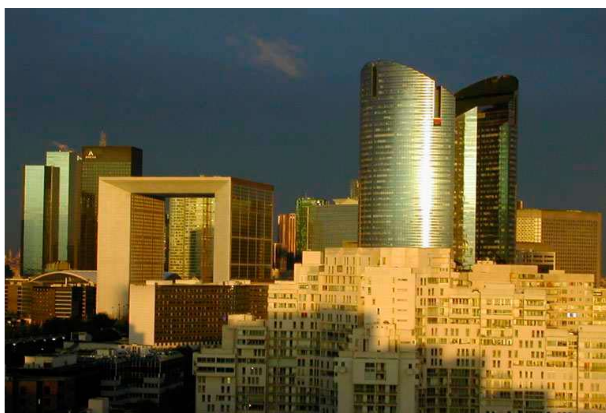
View from the 17th floor, overlooking La Défense on a stormy evening